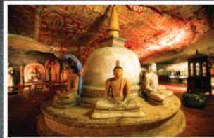
Dambulla Cave Temple