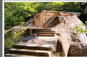
Ritigala National Park