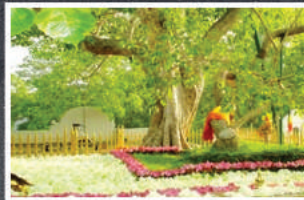
Jaya Sri Maha Bodhi