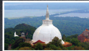
Mihinthhalaya Raja Maha Viharaya