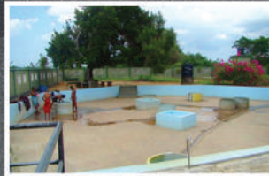
Hot Water Well